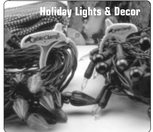
Holiday Lights & Decor